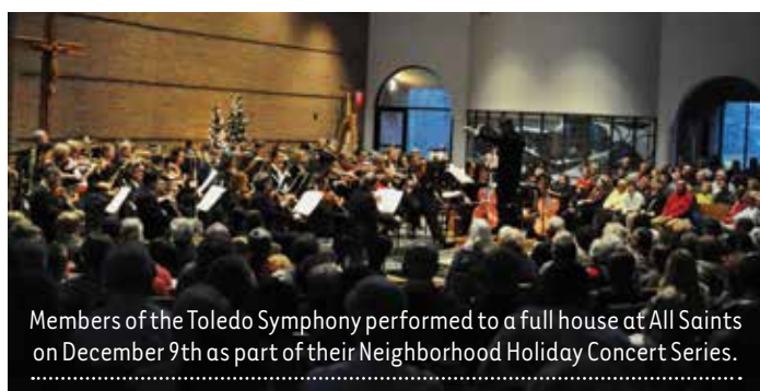
Members of the Toledo Symphony performed to a full house at All Saints on December 9th as part of their Neighborhood Holiday Concert Series.